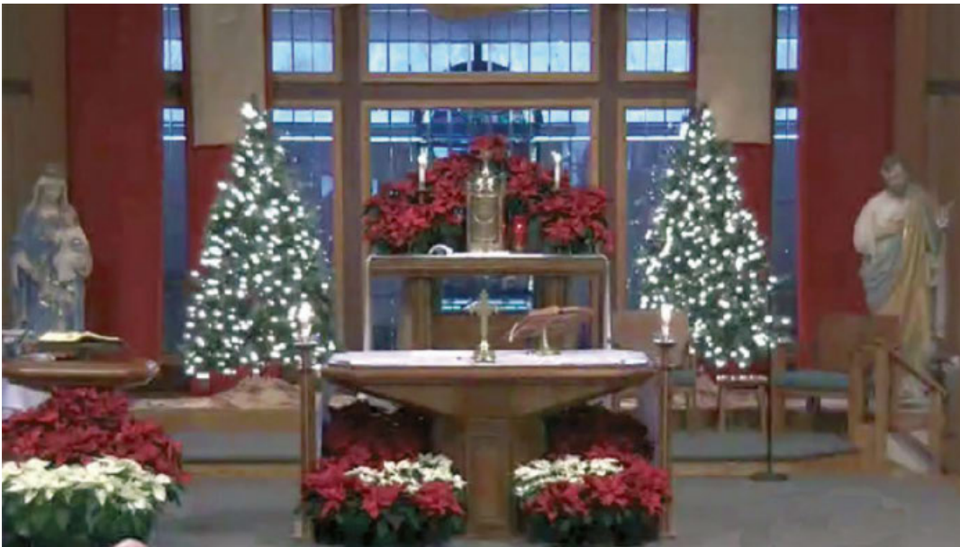
The poinsettias on the Christmas altar were donated in memory of the following people. May we remember them and their loved ones in our prayers.